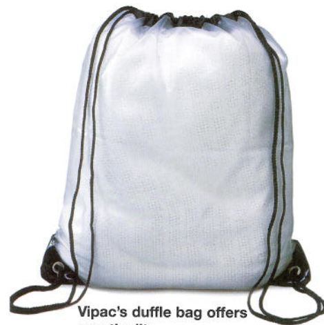
Vipac's duffle bag offers practicality.