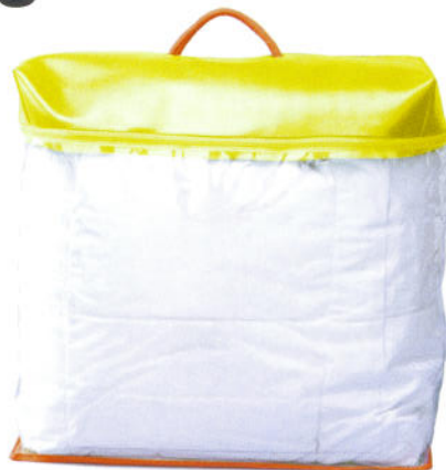
For a basic white bedding product, adding color attracts attention, says Vipac.